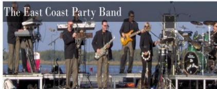
The East Coast Party Band